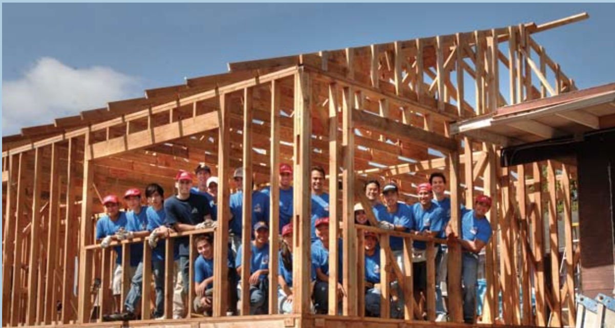
Volunteering to help Honolulu Habitat for Humanity

We are proud to maintain our “Outstanding” rating from the Federal Reserve Bank for our community reinvestment programs.